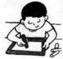
He does his homework

2-I read the text then I answer the following questions. (03pts)