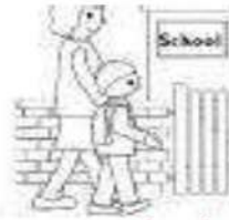
Amir goes to school