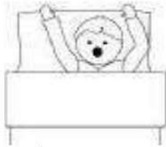
Amir gets up